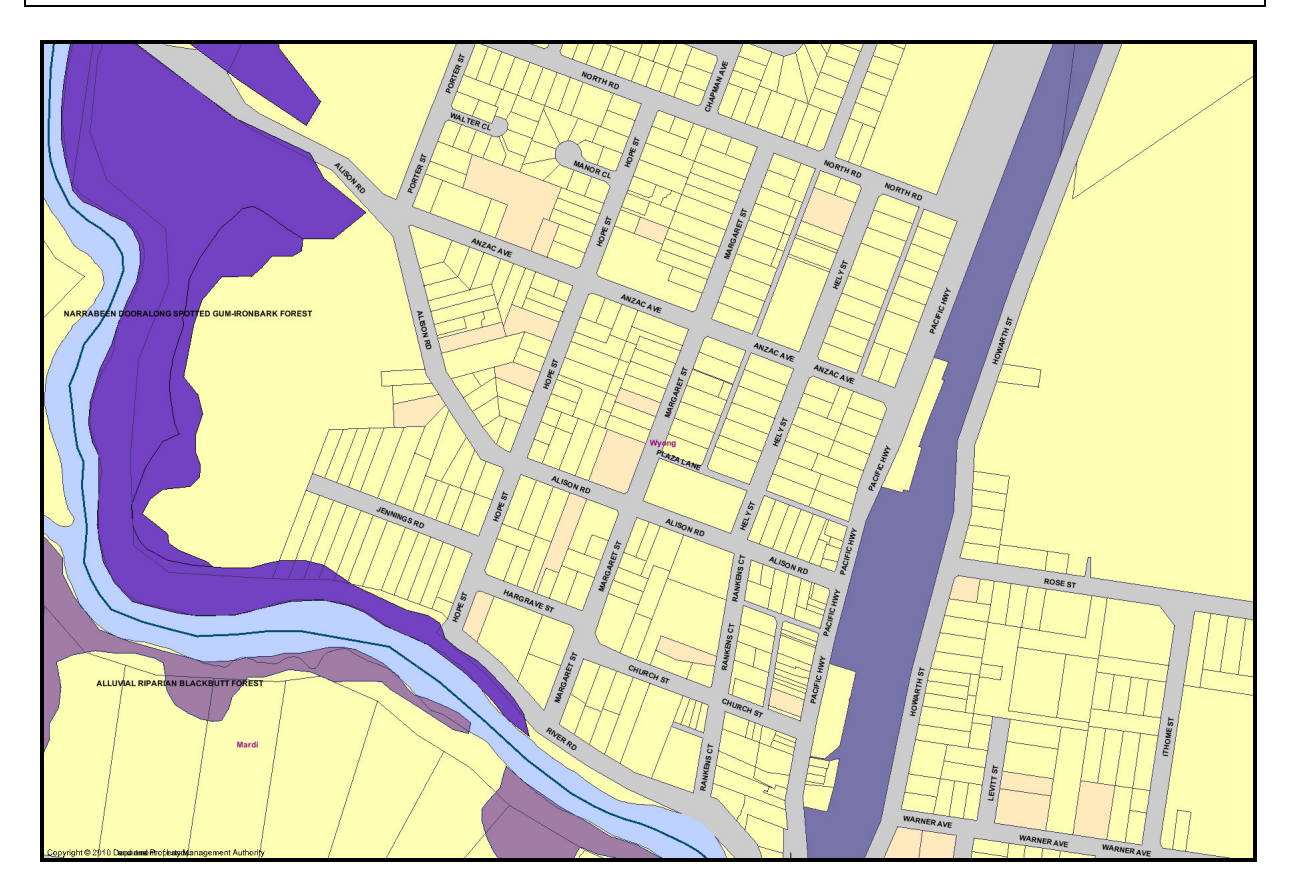
Map Two: Endangered Ecological Communities