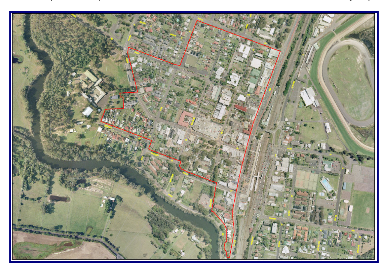
Map One: Wyong Town Centre Planning Proposal (WTCPP) Study Area