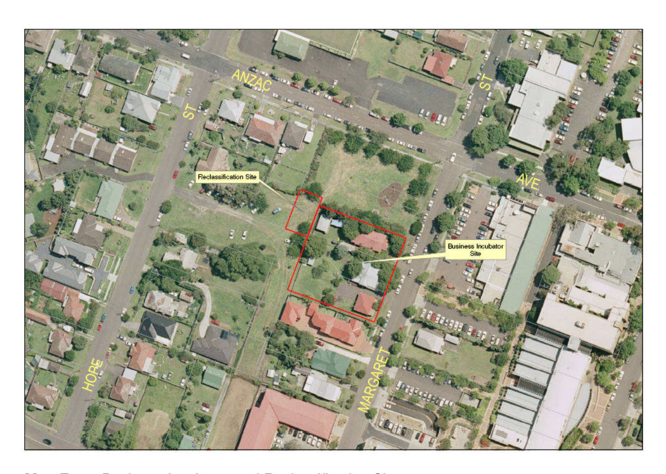
Map Four: Business Incubator and Reclassification Site

Subsequent advice from the DoP has indicated that the reclassification of the land together with the incubator site and the original draft LEP Amendment (No 178) – Wyong Town Centre should be combined into a Planning Proposal. (Refer to Attachment Eight Council Meeting Confidential Item Planning Proposal)